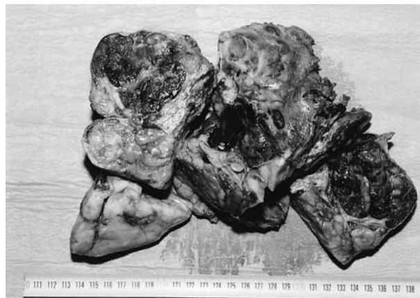
Figure 1. Macroscopically, showing left nephrectomy material and inside it compressed kidney and all around it is big tumoral mass.

20 – 19 cm (Figure 1). Tumor mass was well circumscribed and white in colour (like fish meat) and have areas of hemorrhage, necrosis and calcification. The histologic examination showed that the lesion was composed of large cells with abundant cytoplasm with large vesicular nuclei and prominent nucleolus, representing mature ganglion cells with no or minimal residual neuroblasts and background “schwannian stroma” comprised of organized fascicles of neurotic processes, mature Schwann cells, and fibroblasts (Figure 2).